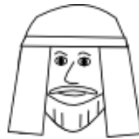
James (brother of John)