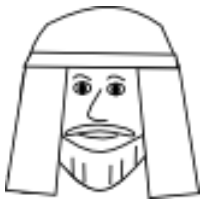
James (son of Alphaeus)