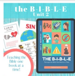
The BIBLE Unit 2: Nehemiah to Micah (13 Week Curriculum) from $97 $125 SALE