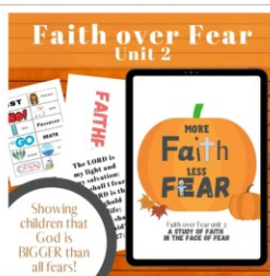
More FAITH Less FEAR: 4-Week Children's Ministry Curriculum (Unit 2 of Faith over Fear) $45