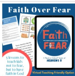
"Faith Over Fear" 5 Lesson Unit for Back-To-School from Hebrews 11 $55