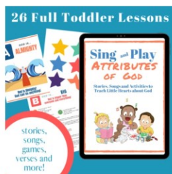
The Ultimate Toddler Bundle: Everything you need to teach age 1-3 about God