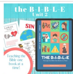
The BIBLE Unit 2: Nehemiah to Micah (13 Week Curriculum) from $97 $125 SALE