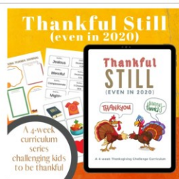
Thankful Still (even in 2020) 4-Week Sunday School Curriculum $45

If your church buys resources, please consider using The Sunday School Store . Church budgets are tight. That's why our digital curriculum is half the cost of printed material. Even when finances are limited, your teaching can make an eternal difference.