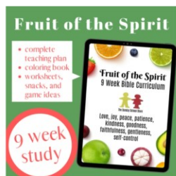
"The Fruit of the Spirit" 9 Unit Curriculum for Kids $57 $90