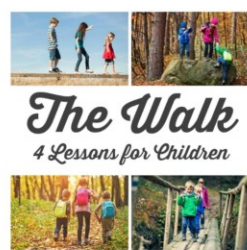
"The Walk" 4 Week Study on Following Jesus $29 $45