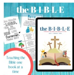
The BIBLE Unit 1: Genesis to Ezra (13 Week Curriculum) from $97 $125