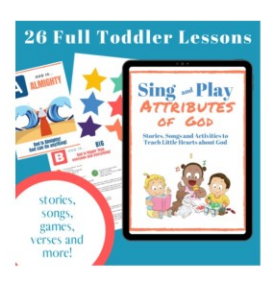
The Ultimate Toddler Bundle: Everything you need to teach age 1-3 about God