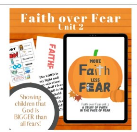
More FAITH Less FEAR: 4-Week Children's Ministry Curriculum (Unit 2 of Faith over Fear) $45