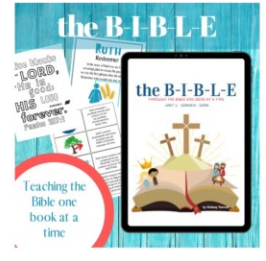
The BIBLE Unit 1: Genesis to Ezra (13 Week Curriculum) from $97 $125