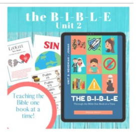
The BIBLE Unit 2: Nehemiah to Micah (13 Week Curriculum) from $97 $125