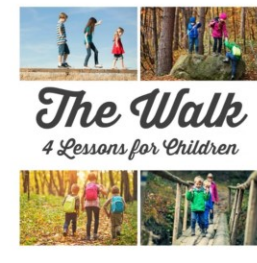
"The Walk" 4 Week Study on Following Jesus $29 $45