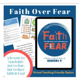
"Faith Over Fear" 5 Lesson Unit for Back-To-School from Hebrews 11 $55