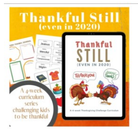
Thankful Still (even in 2020) 4-Week Sunday School Curriculum $45

If your church buys resources, please consider using <u>The Sunday School Store</u>. Church budgets are tight. That's why our digital curriculum is half the cost of printed material. Even when finances are limited, your teaching can make an eternal difference.