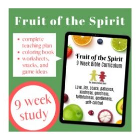
"The Fruit of the Spirit" 9 Unit Curriculum for Kids $57, $90