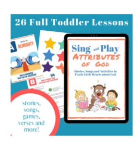
The Ultimate Toddler Bundle: Everything you need to teach age 1-3 about God