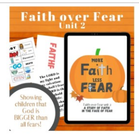
More FAITH Less FEAR: 4-Week Children's Ministry Curriculum (Unit 2 of Faith over Fear) $45