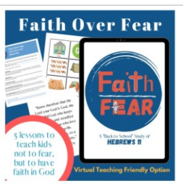
"Faith Over Fear" 5 Lesson Unit for Back-To-School from Hebrews 11