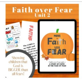
More FAITH Less FEAR: 4-Week Children's Ministry Curriculum (Unit 2 of Faith over Fear) $45