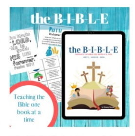
The BIBLE Unit 1: Genesis to Ezra (13 Week Curriculum) from $97 $125