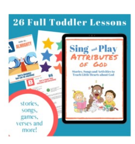
The Ultimate Toddler Bundle: Everything you need to teach age 1-3 about God