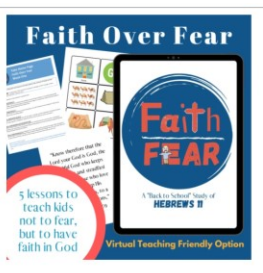
"Faith Over Fear" 5 Lesson Unit for Back-To-School from Hebrews 11