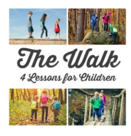
"The Walk" 4 Week Study on Following Jesus $29 $45